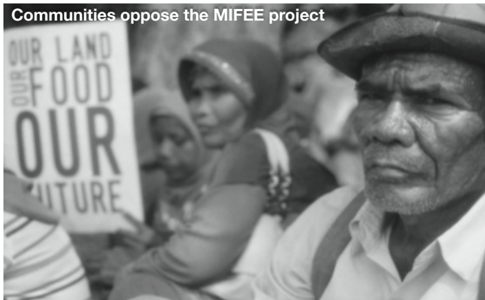
Communities oppose the MIFEE project

Under the New Order era, timber concession rights for PT Sarestra II were granted. The HPH was also given to PT Nusalease Timber Corporation (NTC) based on the Minister of Forestry decision No.845/Kpts-II/1991 on 15 November 1991. This corporation had an HPH of 61,200 hectares in Merangin District, Jambi Province.