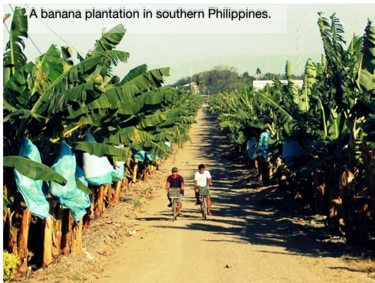
A banana plantation in southern Philippines.

In early 2007, Gapadaro ceased operations in Pantaron due to farm management problems. NEH worked with Gapadaro in recovering the farm and in June 2009 Gapadaro farm management was turned over to NEH at Packing House 84 (PH 84) in Pantaron.