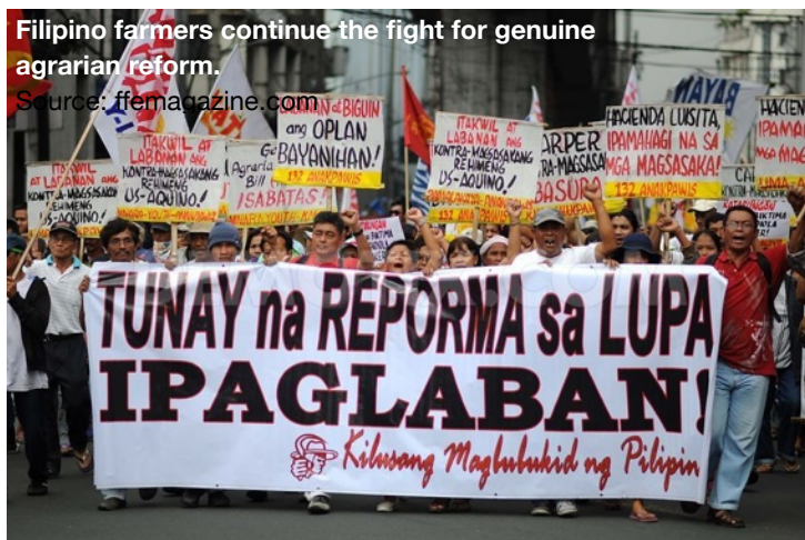
Filipino farmers continue the fight for genuine agrarian reform.

The farmers and agricultural workers have demonstrated the necessity of organizing themselves and educating all the people to wage the struggle for genuine agrarian reform. The continuing foreign control of farmers' lands in Pantaron village highlights this political necessity and the urgency of genuine land re-distribution and re-orienting production planning for the full benefit of the local community and society.