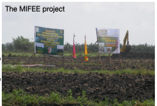
The MIFEE project

The MIFEE is considered as an integrated food and energy estate project. In addition to farming, the project will support a wide range of agricultural businesses, including post-