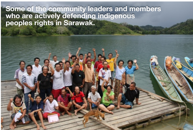
Some of the community leaders and members who are actively defending indigenous peoples rights in Sarawak.

Aside from the titles given by the British colonial government, another concrete evidence of the NCR was a document ordering a logging company, Hua Seng Sdn Bhd to pay fines for trespassing into the sacred burial site of the Iban and the Melanau communities. The said site is situated at the mouth of the Sungai Anak Besar, a tributary of Ilas River. The indigenous peoples filed a suit of Trespassing Ilas River Cemetery on 11 January 1998. On 21 January 1998