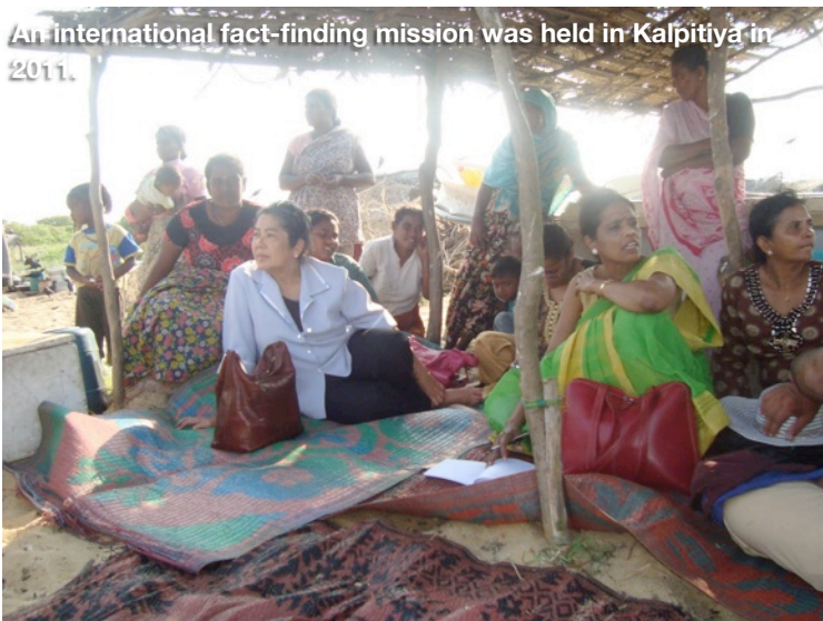
An international fact-finding mission was held in Kalpitiya in 2011.

Paddy is the major crop of the area while vegetables, cereals, pulses, root crops and spices are cultivated as the minor crops. Eighty-two percent of the farmers are cultivating paddy and are highly dependent on the irrigated water of Weli Oya. Loss of vegetation caused by deforestation