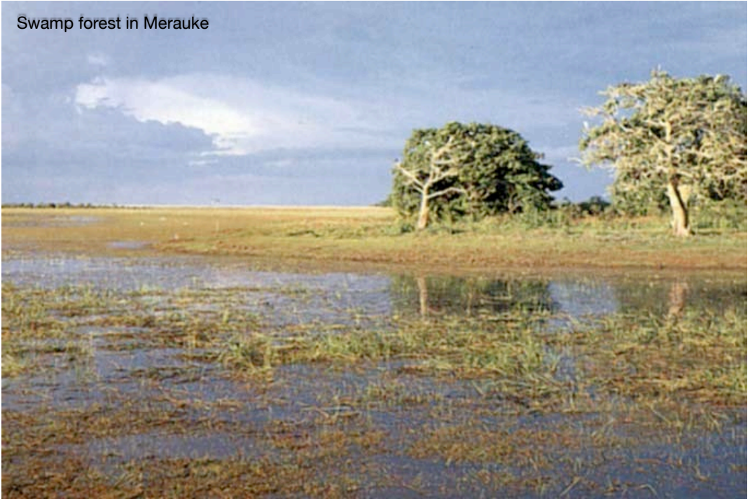
Swamp forest in Merauke