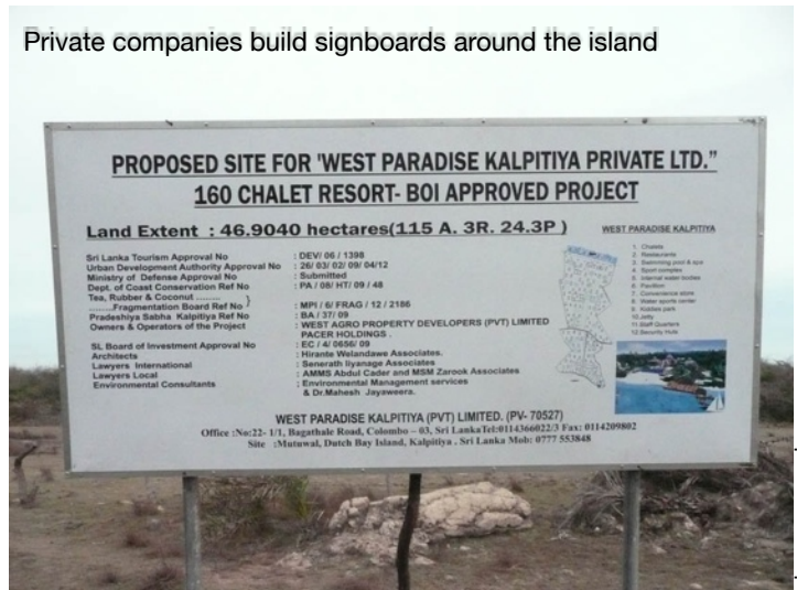
Private companies build signboards around the island

The Sri Lanka Tourism Board claims that the Kalpitiya Integrated Tourism Development Project will generate at least 15,000 jobs directly and a further 22,500 jobs indirectly. It is important to note, however, that the resorts being planned are essentially upscale properties targeting the higher end of the global and regional tourist spells decline in nation-traffic. Minimum requirements for frontline service staff