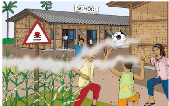
Play in yards/fields/gardens that have been sprayed or are reached by pesticide drift