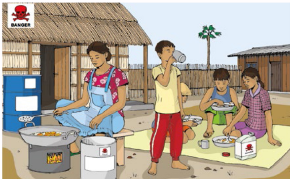
Reuse of pesticide containers for food and water storage