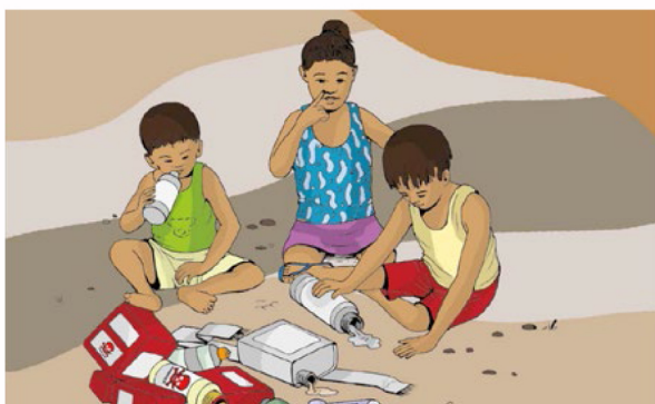
Play with pesticide containers