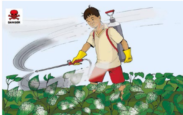
Spray pesticides in the farm