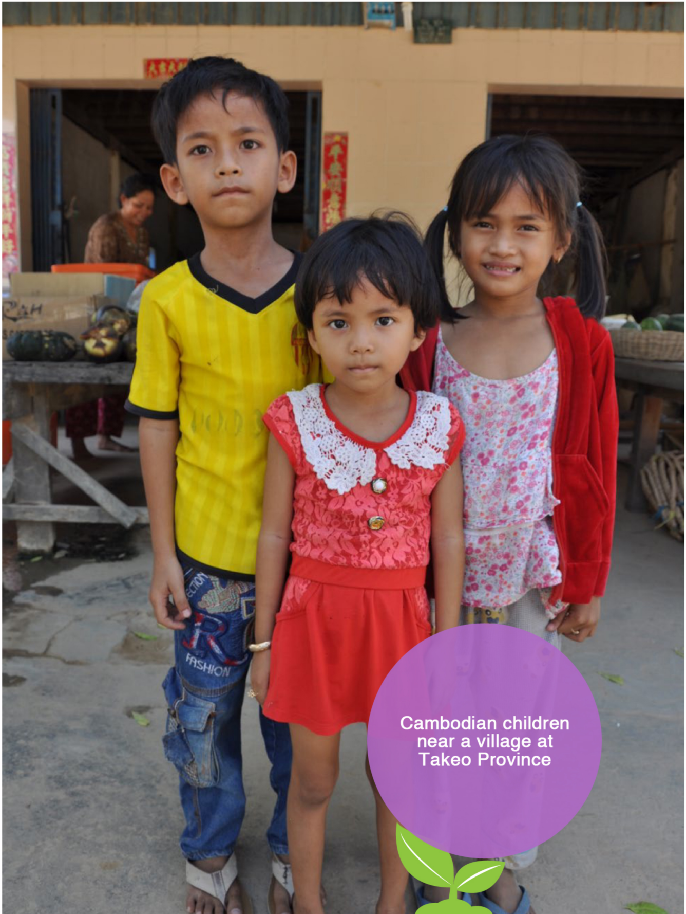
Cambodian children near a village at Takeo Province