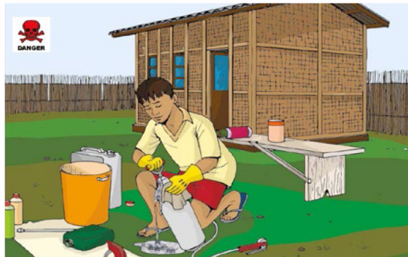
Clean containers or equipment used to apply pesticides