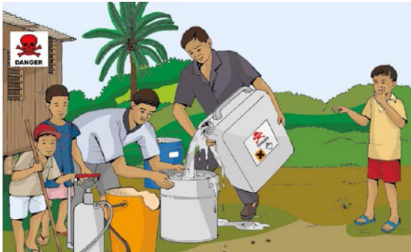
Prepare and/or mix pesticides