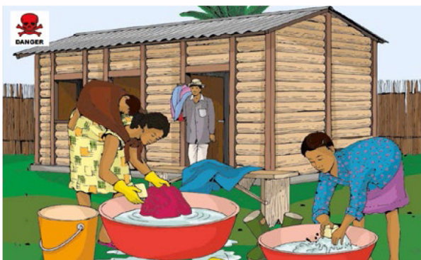
Wash clothes that were used in pesticide preparation/application or in pesticide sprayed farms