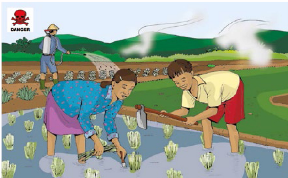
Work in fields that are sprayed with pesticides