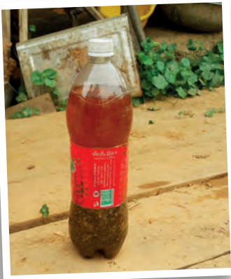
Bouchan's organic pesticide made from chilies, garlic, gallanga and various other plants.

We started in 2009, with SAEDA's intervention and training on methods based on agroecology. The project promoted local seed selection, production and conservation.