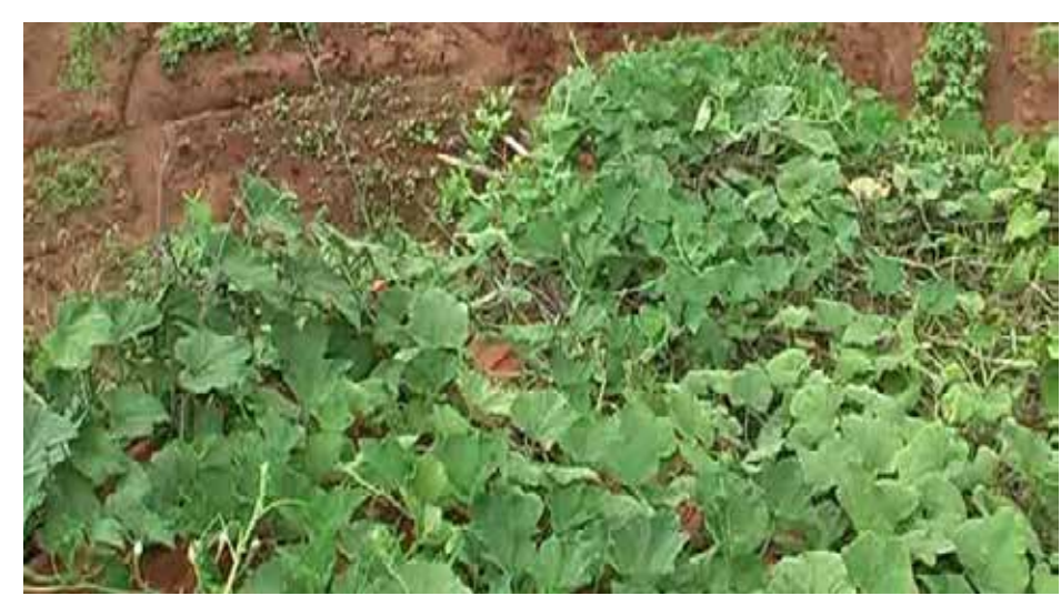
Permaculture method of Kitchen Garden (GREEN Foundation)

the making. And as she says, "It all began with the kitchen garden." GREEN initiates the setting up of kitchen gardens for small scale and marginal farming families, with an aim to strengthen their food security. Over the years, some 950 kitchen gardens have been set up through these efforts, positively impacting the lives of as many families.