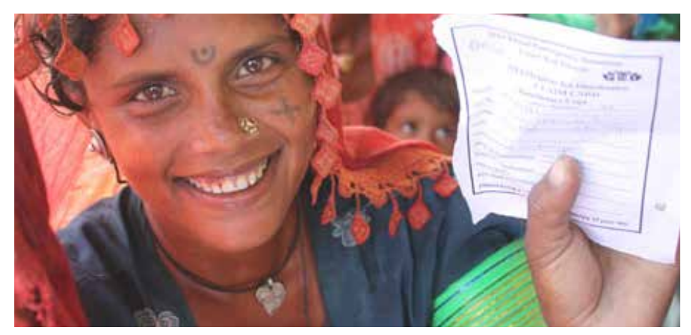
A woman holding a certificate of land ownership

their contribution in agriculture. The very fact that a woman has to leave the land in favour of other men in the family after the death of her husband, no matter how active she may have been on the farm alongside her husband, shows that women are not recognised as farmers.