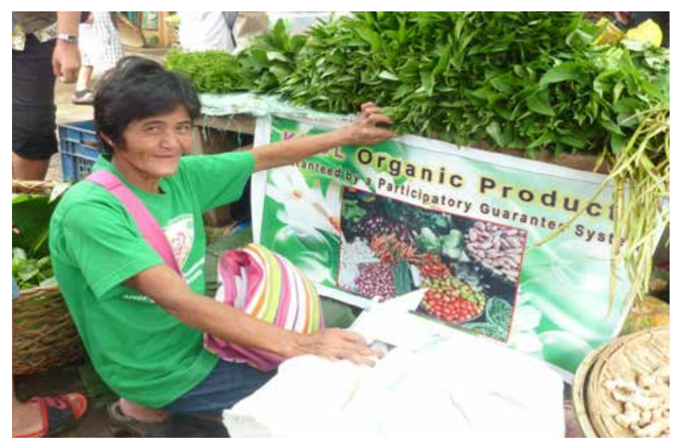
Women sell organic vegetables at the Calinan market every Sunday.

It was quite a welcome development, then, when the DA changed its course and started implementing Republic Act 10068, called the Organic Agriculture Act of 2010. This law provides for the development and promotion of organic agriculture in the country, with focus on policy formulation, research development and extension, the establishment of facilities and the implementation of organic agriculture programmes at the local, regional and national levels. The Act recognises and supports the central role of farmers and indigenous peoples in the development of organic agriculture, and appoints a National Organic Agriculture Board to formulate policies and guidelines at the national level and for technical bodies to oversee implementation at the local level.