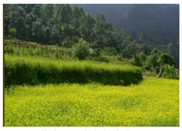
Biodiverse ecological agriculture (Beej Bachao Aandolan)

Availability of traditional seeds was not the same in all the villages. It was also different amongst different communities. As stated proudly by Hemanti, "We had continued growing traditional seeds despite the lure and attraction of the market. Thankfully, some of