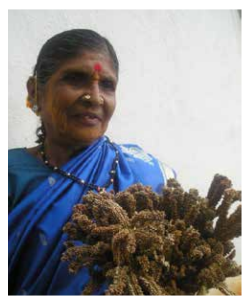
Woman farmer with indigenous varieties of finger millet

the Second World War. The impact has been an irreversible loss in the genetic diversity for the Indian Agriculture that farmers had nurtured over the centuries. The heirloom seeds that farmers held in their possession were the living links in an unbroken relationship to the land reaching back to antiquity. Farmers' centuries ago, especially women began domesticating crops with the simple acts of selecting seeds for re-sowing. It is well known that seed selection and breeding are sophisticated skills that have evolved over generation in the hands of women. Saving seeds thus became a part of the culture and tradition that made agriculture a way of life. Today, industrialisation of farming has taken rapid strides so much so that cultural diversity and biological diversity have become major issues of concern. Despite