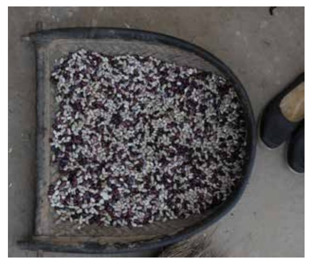
Diversity in view: diverse variety of kidney beans. (Reetu Sogani)

at four in the morning, work non-stop till late hours in the evening. Women's lives are very hard, in the hills".