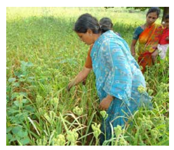
Women participating in seed selection (GREEN Foundation)

seeds in the future that are suited to our needs," she says. "We are more certain of good yields," she adds.