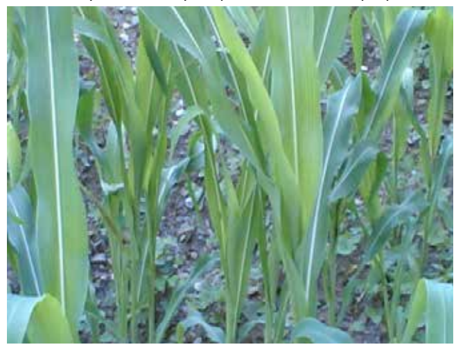
Chari, a plant which is used as fodder plant and also used for making broom (Reetu Sogani)

collection. processing and their storage. Hinting upon some of the unique traditional methods, she continued, "Seeds were either stored in 'tumri' (hollowed gourd shells) or 'bhakars' (wooden boxes made of chir/pine wood) and occasionally in covered bamboo or 'rinaal' baskets plastered with cow dung from inside popularly called 'korangi' (they are not much in use now). Seeds were usually mixed with