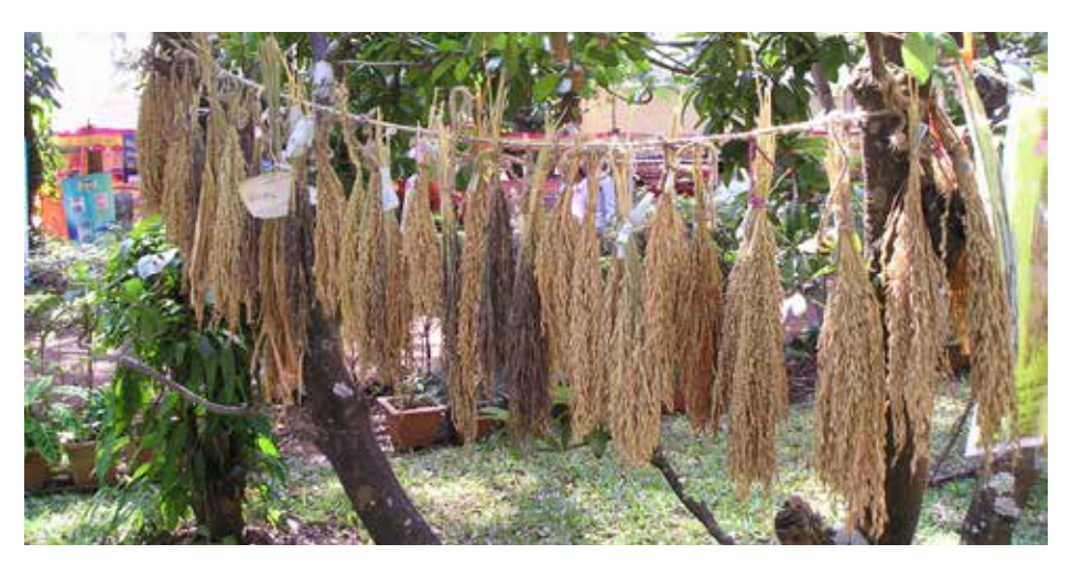
Diverse Paddy Varieties (GREEN Foundation)

Technological revolution heralded the advent of miracle seed during the green revolution period when the high yielding varieties that responded to external chemical inputs replaced the indigenous diversity that were held by farmers, just after