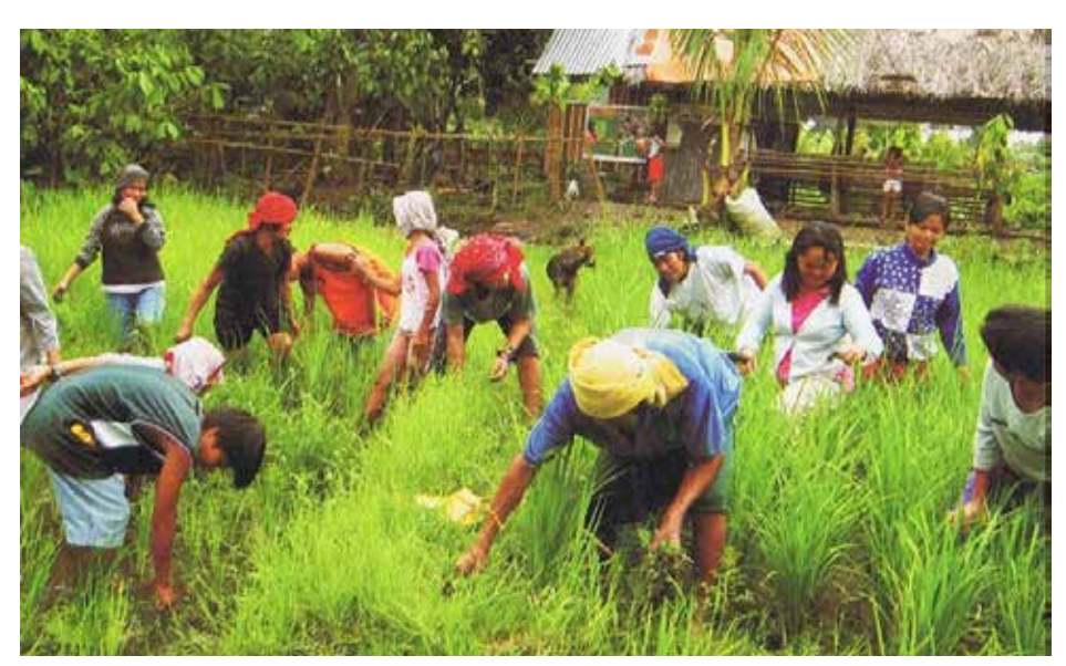
Members of the Bayanihan Women's Organisation (of KNBL federation) and their youth revive the old Filipino practice of 'bayanihan', lending their labour in each other's farms.

"A farmer should have many varieties in her farm, not only one. So I chose the best ones for my farm, and now I have five of the best in mass production, including M138, M135 (Masipag collections); Manumbalay and an adapted Jasmine. Manumbalay, a Philippine traditional rice variety, is very aromatic."