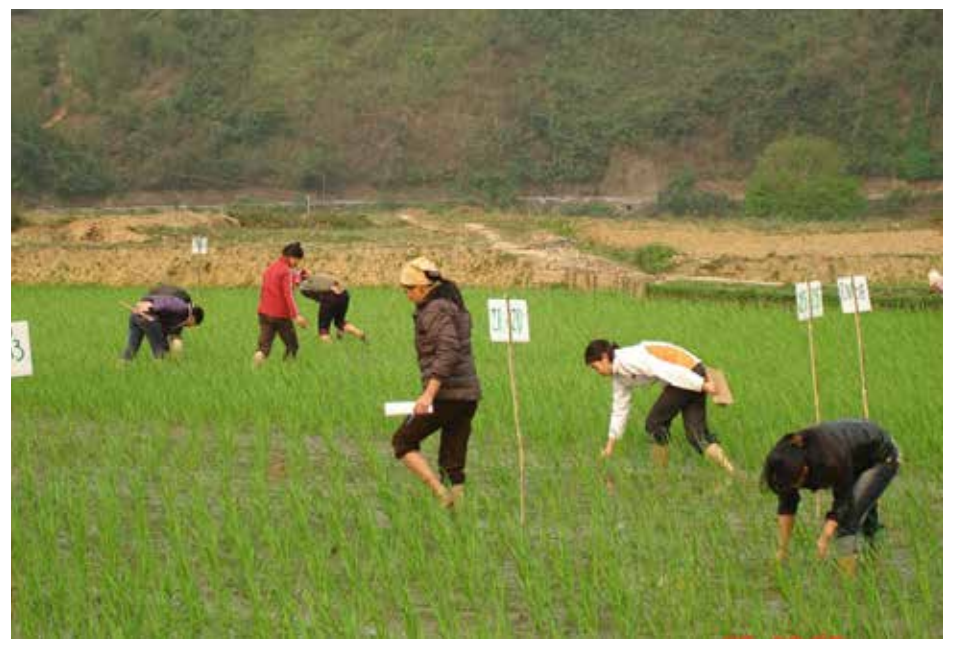
Farmers on the preservation field of Khang Dan rice (local seed) (SRD)

The interventions of the project therefore focus on providing technical knowledge and skills for local farmers' know-how to rehabilitate local varieties, compare, evaluate and select the appropriate rice varieties contributing to the diversification of rice genetic resource and adapting to the negative effects of climate change. Preservation and development of rice seed varieties have helped farmers enhance their decision-making capacity in selecting the most appropriate rice varieties to households' capacity as well as local ecosystem. Moreover, exchanging rice seeds within the community helps reduce the proportion of using hybrid rice seeds. The result of the evaluation showed that the proportion of hybrid rice varieties has been reduced from 60% to 20% at project communes.